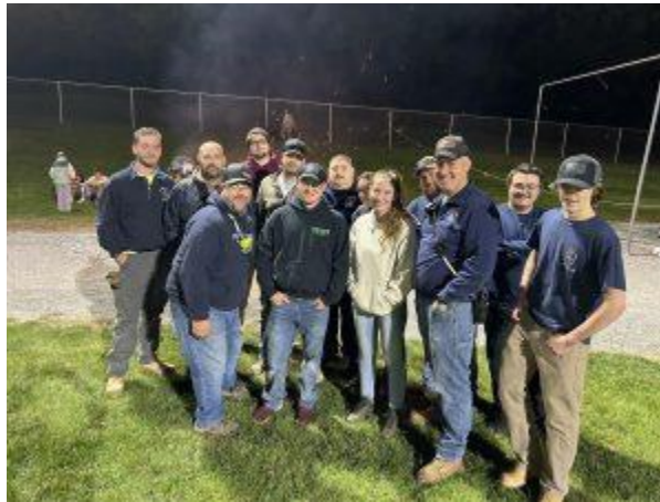
A few members of the Citizens Fire Company of Newport PA

The 2025 Convention is scheduled at Newport Fire Company, 301 Mulberry St, Newport, PA 17074. The Citizen's Fire Company was founded in 1925 and is one of 12 fire companies in Perry County. Citizens is celebrating the entire week with events each day and evening. The CVVFA Convention begins Wednesday July 30th and continues until August 2nd when a huge parade takes place in Newport. CVVFA members are invited to attend the entire week.