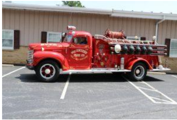
VFC of Halfway MD 1st Engine 1945 International