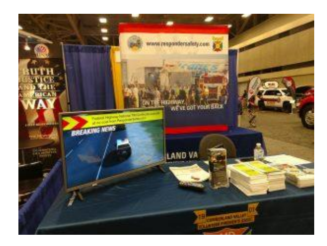
ResponderSafety Booth in Dallas

Following the 117th Annual Convention in Fairplay MD, members of the CVVFA fanned out across the country delivering our life safety message on Highway Incident Scene Safety in 5 states, 4 in the same week.