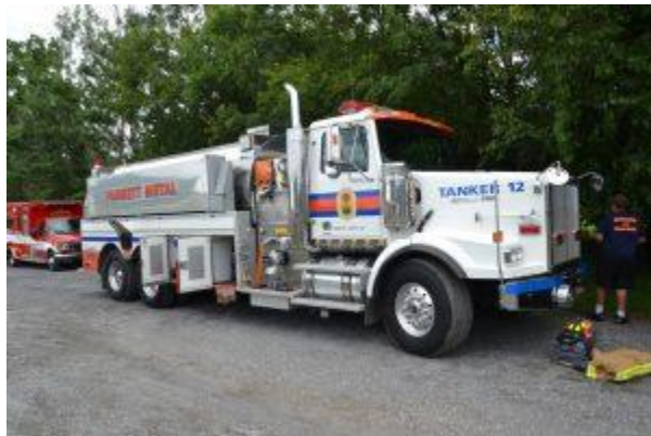
Big water for big fires in the mountains of PA

The 116th Annual Convention opened in McConnellsburg PA with the Annual Memorial Service and business meeting. Members from 5 states are already registered. The membership established a budget for the coming year.