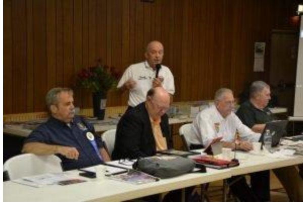
MD Delegation presents at the Presidents Council