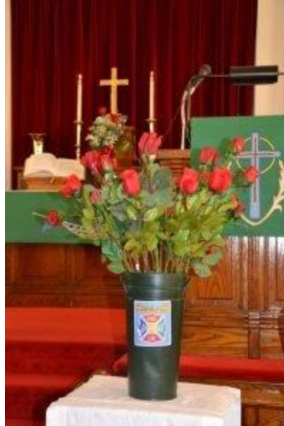
A rose remembers the CVVFA Members who passed during the past year. The Memorial Service opened the Convention.