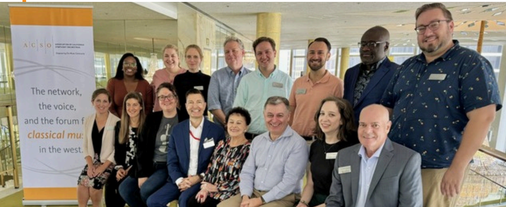
ACSO Board Meeting, October 2024, The Music Center, Los Angeles