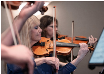
Hutchins Consort performs at Conference Closing Plenary