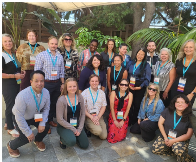
Emerging Professionals Brown Bag Lunch