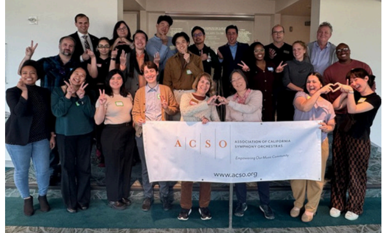
2025 ACSO Youth Confab

On March 28, 24 youth orchestra leaders gathered in San Luis Obispo for a day of learning and networking (and axe-throwing!) Discussion topics included growing scholarship funds, designing gender-inclusive policies, board diversity, best practices in social media, recruiting music directors, and centering the student perspective.