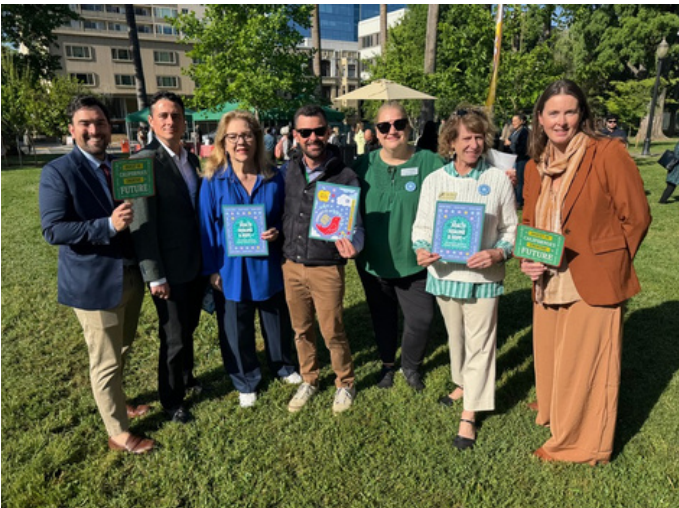
Orchestras at the State Capitol for 2025 Arts Advocacy Day