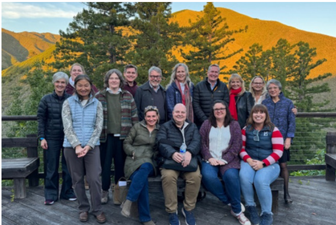
2025 Orchestra CEO Retreat

Eighteen orchestra leaders gathered in Big Sur on January 13, in partnership with the Monterey Symphony and the Big Sur Land Trust, to examine the orchestra business model, strengthen board development, and offer peer-to-peer learning and support.