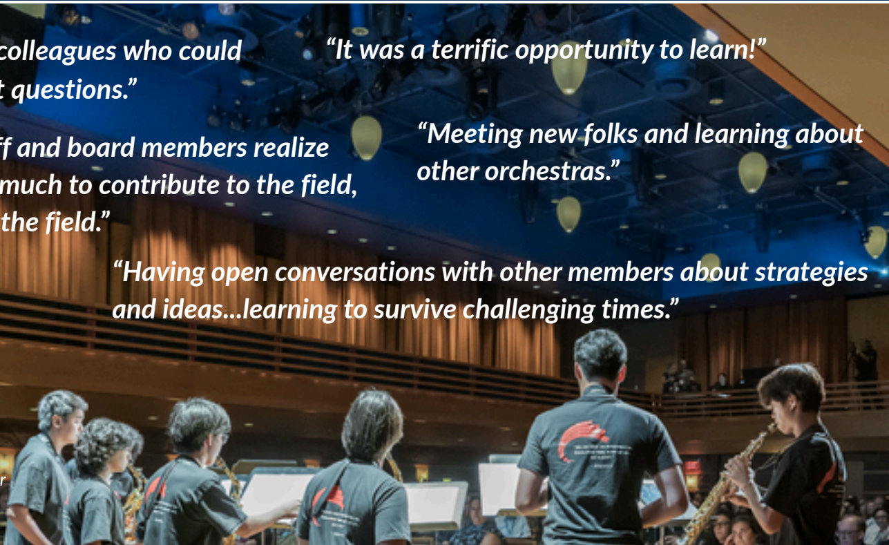
Pacific Symphony Youth Ensembles Saxophone Choir performs at Conference Opening Plenary