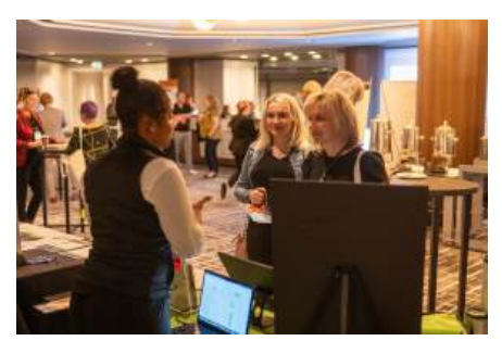
Above: Photos from the ACSO 2024 Annual Conference