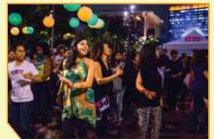
DANCE DTLA

Featuring music by Sidestepper and Buyepongo: Music that will move you, emotionally and on your feet! Sidestepper, the pioneers of Columbia's electro-cumbia movement, highlight their acoustic roots for your dancing pleasure. Buyepongo will lead you across boundaries of sound and rhythm with their buoyant fusion of global influences.