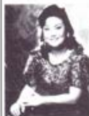
Hai-Kyung Suh piano

enormous flair and almost dizzying dexterity. The Miami Herald