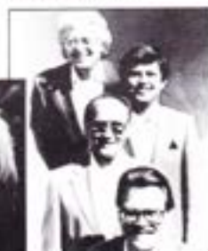
THE FOUR FRESHMEN