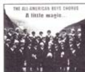
THE ALL-AMERICAN BOYS CHORUS