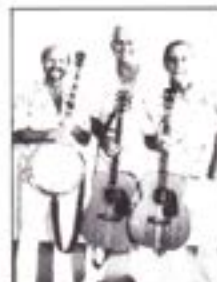
THE KINGSTON TRIO