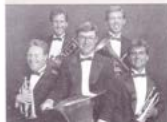
The Make Believe Brass

The Make Believe Brass Graciously sponsored by California Artists Management