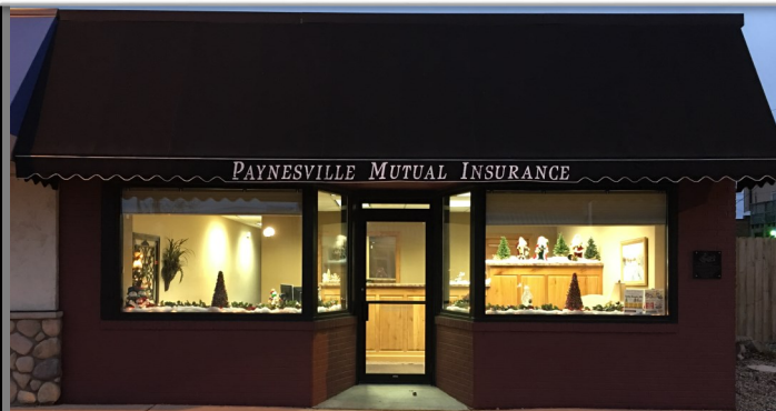
Paynesville Mutual Building