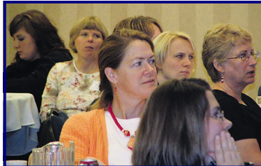
Some of the ladies listening intently during the Support Staff Seminar at the St. Cloud Holiday Inn.