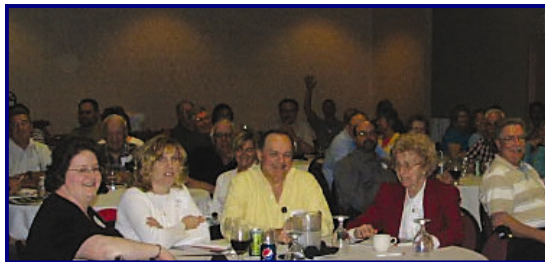
Some happy campers at one of the four Spring Agents' Meetings.