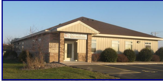
Southeast Mutual in St. Charles, Minn.

Through the changing face of the company, Southeast Mutual has never lost their mission to remain a financially sound company that perpetuates a stable insurance market for farm and home owners alike. They strive to provide competitively priced insurance products for comprehensive coverages as well as handle their claims promptly and provide excellent service to their agents and policyholders.