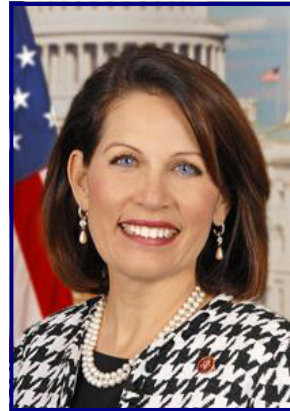
Congresswoman Michele Bachmann made a visit to the MAFMIC Office February 19.

The latter was the case in the Senate but the House claimed the bill had to go to