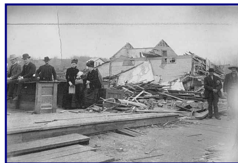
1820 Sauk Rapids Tornado.

The most probable time for a tornado in Minnesota is between 2 PM and 9 PM, but they can occur almost any time of the day or night. So as spring in Minnesota arrives, be on the alert for severe thunderstorms and the tornadoes these storms sometimes spawn.