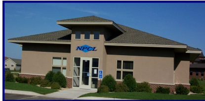
NPCL building built in 2001

NPCL supports local 4-H clubs, FFA organizations, New Prague Area School programs, New Prague Fire and Ambulance depart-