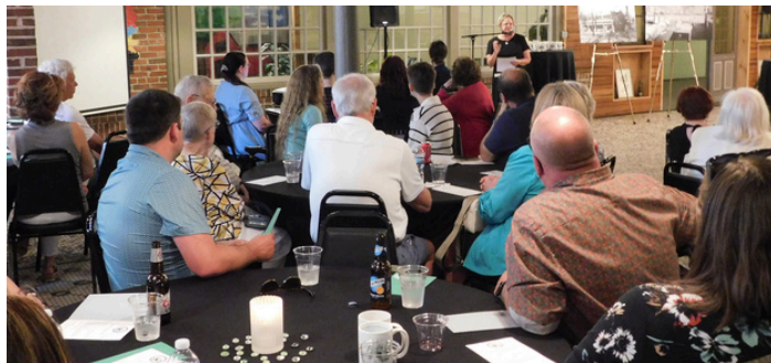
Left and Below: SCHS Members and Guests