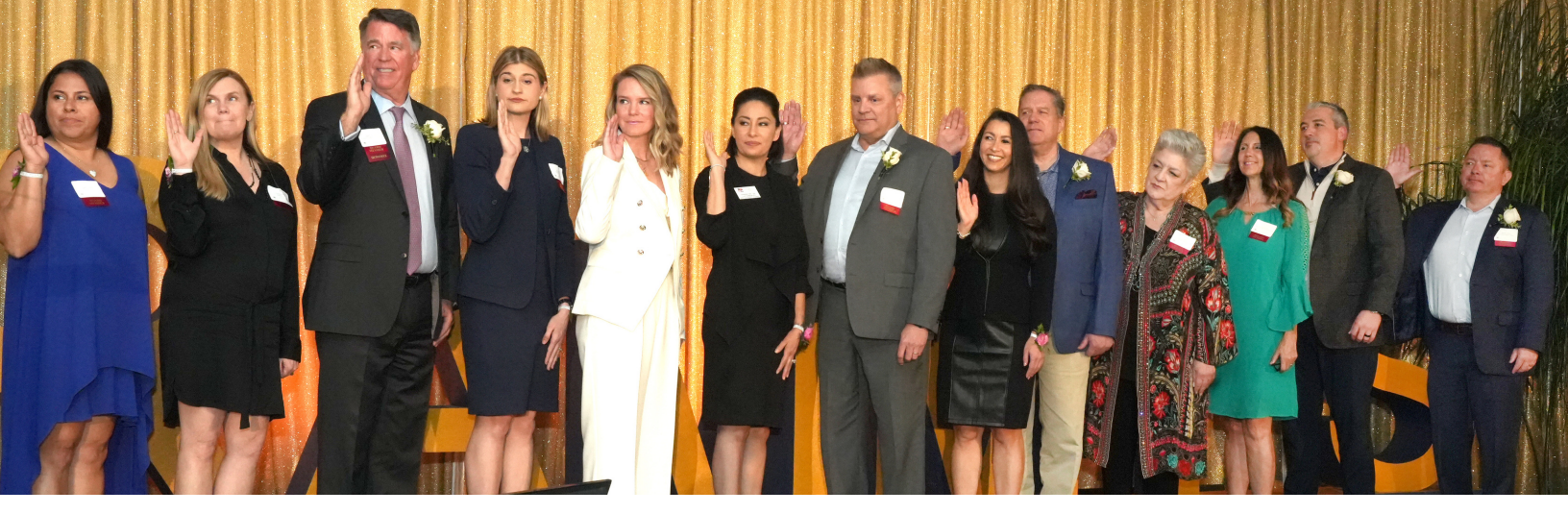
Board of Directors: Champions for Business. Catalysts for Growth. Conveners of Leaders and Influencers.