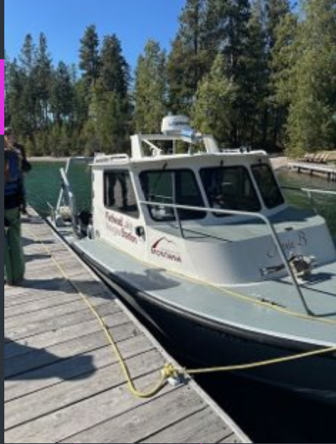
Research Boat -Flathead Lake Biological Station