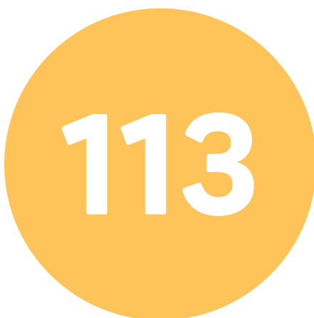
Number of billion-dollar disasters in the U.S. between 2015–2019, a 25% increase from the 1980s

U.S. News reports Mother Nature wreaked havoc on almost every U.S. state between 2010 and 2019. From droughts, floods and tornado outbreaks to hurricanes, winter storms and wildfires, communities across the United States weathered significant storm damage in the past decade