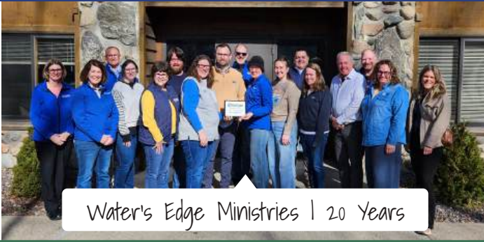
Waters Edge Ministries | 20 Years