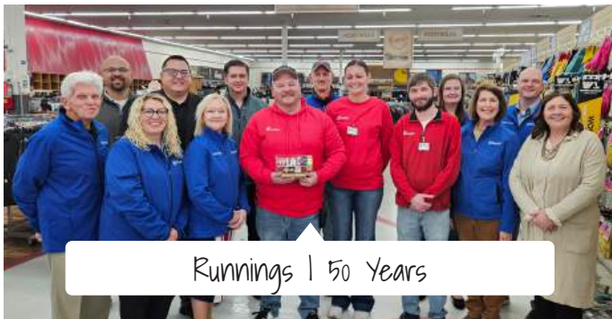
Runnings | 50 Years