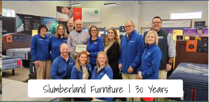
Slumberland Furniture | 30 Years