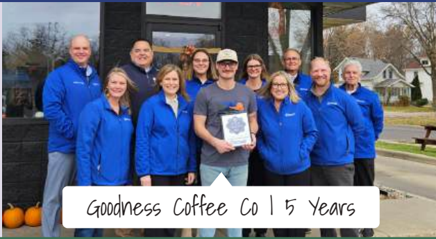
Goodness Coffee Co | 5 Years