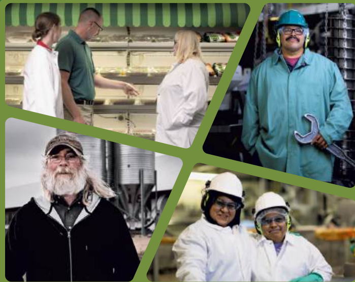
© 2024 Jennie-O Turkey Store, LLC