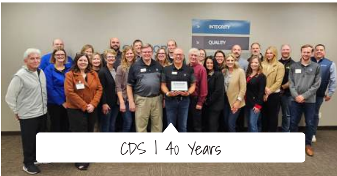
CDS | 40 Years

Membership Milestones recognize member businesses for their continued investment and commitment to the Chamber. Hosted by the Diplomats Committee, these visits foster connections, goodwill, and a stronger business community.