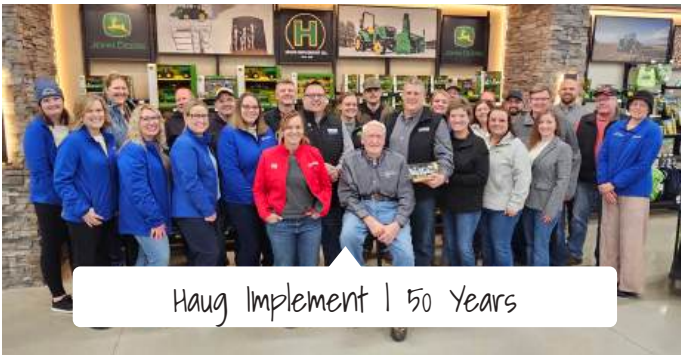
Haug Implement | 50 Years