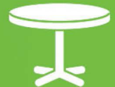
TABLES + COUNTERS