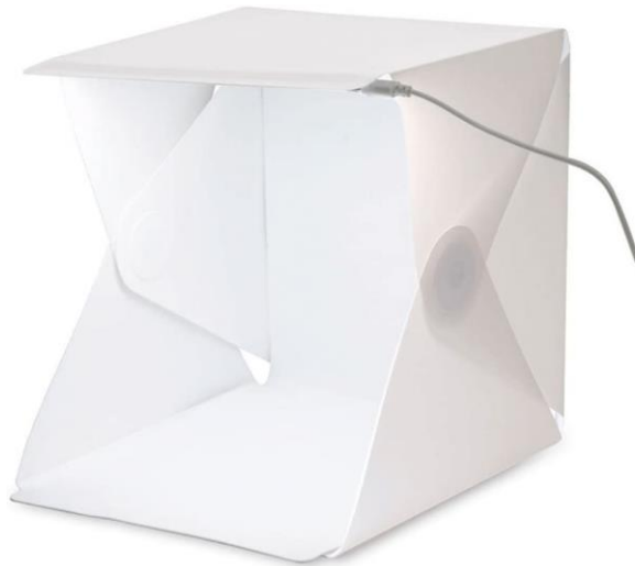
9.45", One LED bar lights, no top opening, $10.99