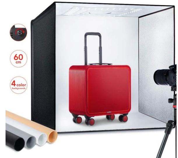
24", LED square lights, top opening, $98.94