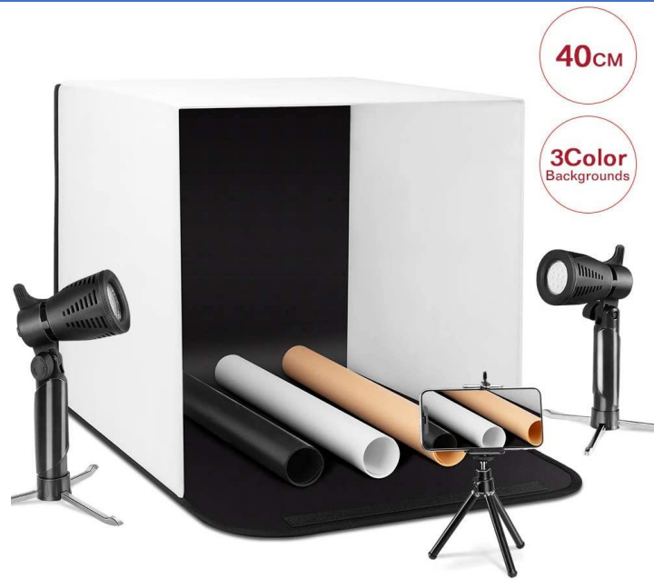
15.75", 2 external lights, no top opening, $44.85