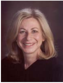
Honorable Sharon Prost, Chief Judge – United States Court of Appeals for the Federal Circuit

Sharon Prost was appointed by President George W. Bush in 2001 and assumed the duties of Chief Circuit Judge on May 31, 2014. Prior to her appointment, Judge Prost served as Minority Chief Counsel, Deputy Chief Counsel, and Chief Counsel of the Committee on the Judiciary, United States Senate from 1993 to 2001. She also served as Chief Labor Counsel (Minority), Senate Committee on Labor and Human Resources from 1989 to 1993. Prior to her work on Capitol Hill, she served for fifteen years in five different agencies of the executive branch. These agencies included the Department of the Treasury, National Labor Relations Board, and General Accounting Office. Judge Prost received a B.S. from Cornell University in 1973, an M.B.A. from George Washington University in