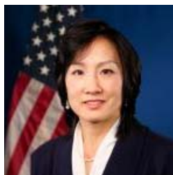
Michelle K. Lee, Director of the USPTO