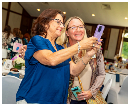
Table Partner - $500