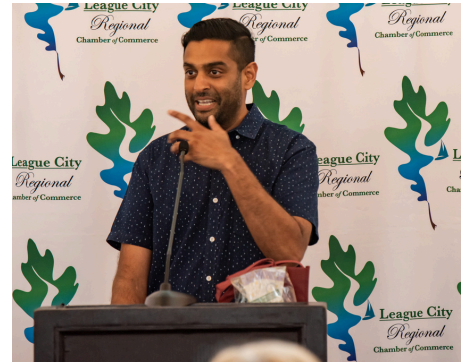
Table Partner - $500