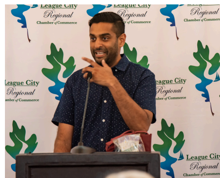
Table Partner - $500