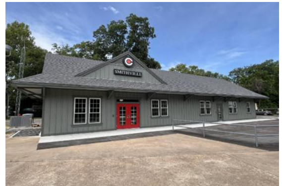
Smithville Station completed

For example, in Smithville, the transit station tells a story that reaches beyond transportation. With roots tied to the town's railroad heritage, the station has long held a prominent place in the community. Today, thanks to rural discretionary funding awarded to Capital Area Rural Transportation Systems (CARTS), a PTN subrecipient, that legacy is being carried forward through thoughtful improvements that breathe new life into the site. In 2024, CARTS received funding to build a new transit facility designed to serve the community for decades to come. Completed in March 2026, the facility includes a passenger waiting area, dispatch and ticketing space, offices, a driver break room, and a multi-use training room shared with the local workforce agency. More than a transit stop, Smithville station continues to grow as a community resource—honoring the past while helping support the town's future.