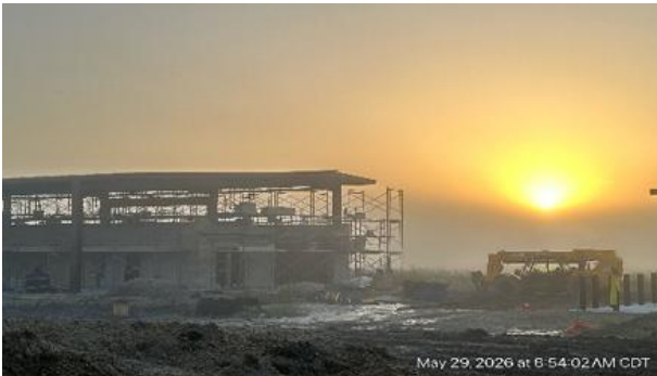
REAL Project under construction

Accessibility Project continues that momentum through expanded covered parking, improved ADA access, and better site circulation. Meanwhile, in Alice, the Rual Economic Assistance League (REAL) is advancing a multimodal administration, operations, and maintenance facility that will provide dedicated space for staff, dispatch, vehicle storage, inspection, and repair, helping reduce reliance on outsourced services and support stronger transit delivery across the region.