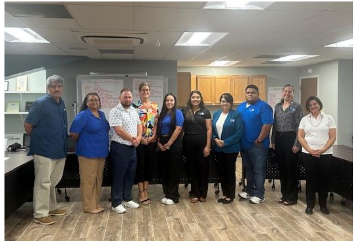
New Transit Manager Training in Uvalde, TX

Please see TTA's full training calendar for all session descriptions or for registration. Remember, these courses are offered to transit agencies in Texas at no cost by grant funding through TxDOT.