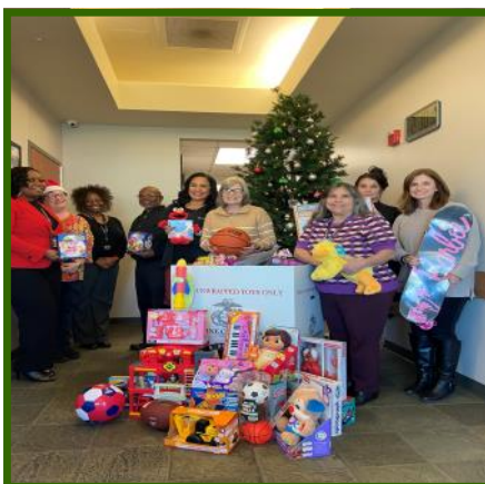
Waco Transit System