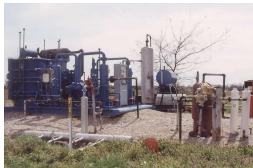
Compressor Station with Desiccant Dehydrator

The operating parameters and designs of compressor stations are dependent on the volume and pressure of gas available from the wells it serves, the pressure of the pipeline the gas is being delivered into, and the water content of the gas moving through it. The larger field compressor stations, which can deliver several hundred Mcf per day into gas gathering systems or transmission pipelines usually include compressors with natural gas fueled engines with higher horse power ratings and include glycol dehydration equipment. But by far the most prevalent compressor stations operated by the small companies in the Appalachian Basin include compressors that move between 100 and 200 Mcf/day and driven by either electric motors or natural gas fueled engines of 150 horsepower or less. The majority of these size compressor stations only have compressors and their drivers, but glycol or desiccant dehydrators may be required in cases where water content of the gas is high.