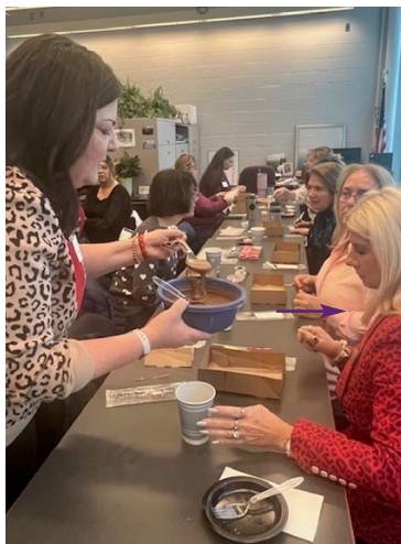
Chocolate making on Valentine's Day