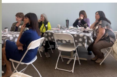
Learning about decluttering in March at Promenade Senior Living