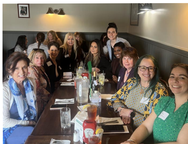
April was National Brunch Month. WIBI celebrated at the Mahwah Bar & Grill