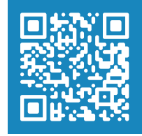
Annual Conference Registration

Please complete this form and return with payment to MHHA, 2140 University Park Drive, Suite 220, Okemos, MI 48864 . Application with credit card payment may be faxed to (517) 349-8090 or by going to www.mhha.org to register and make payment online.