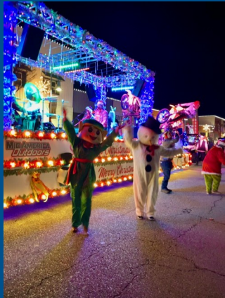
Lights On Grand Christmas Festival & Parade

Membership investment in the Grove Area Chamber of Commerce is tax deductible as an ordinary and necessary business expense. Investments paid to the Chamber are not a charitable tax deduction for Federal Income Tax purposes. The Chamber is not a charity; however, it serves as an advocate organization for area business.