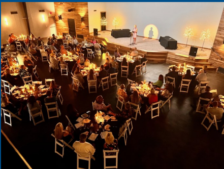
Chamber Awards Gala