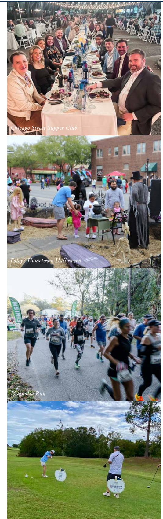
Golf FORE! Education

Halloween brings its own kind of magic, and the City of Foley is gearing up for the much-anticipated Hometown Halloween on October 24, 2024. Children clad in costumes of all shapes and sizes flood the streets, laughter ringing out as they trick-or-treat among neighbors. The city buzzes with excitement, and local shops join in the fun, transforming their storefronts into whimsical displays that