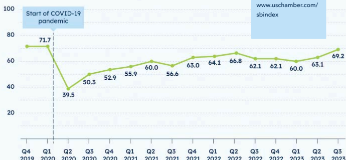
Small Business Index Score Q4 2019 - Q3 2023

To explore and browse years of small business data, visit: www.uschamber.com/sbindex