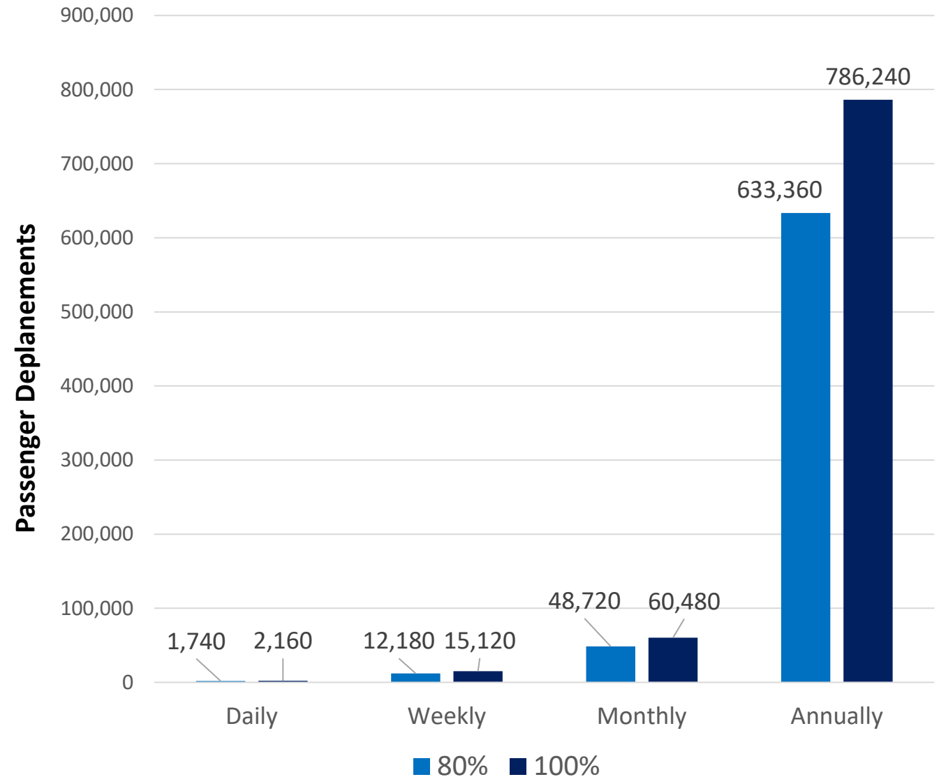
Potential Breeze Passenger Deplanements Assuming 80% and 100% Capacity and 20 Inbound Flights a Day

*Note: 100% capacity calculations show potential growth, not current data