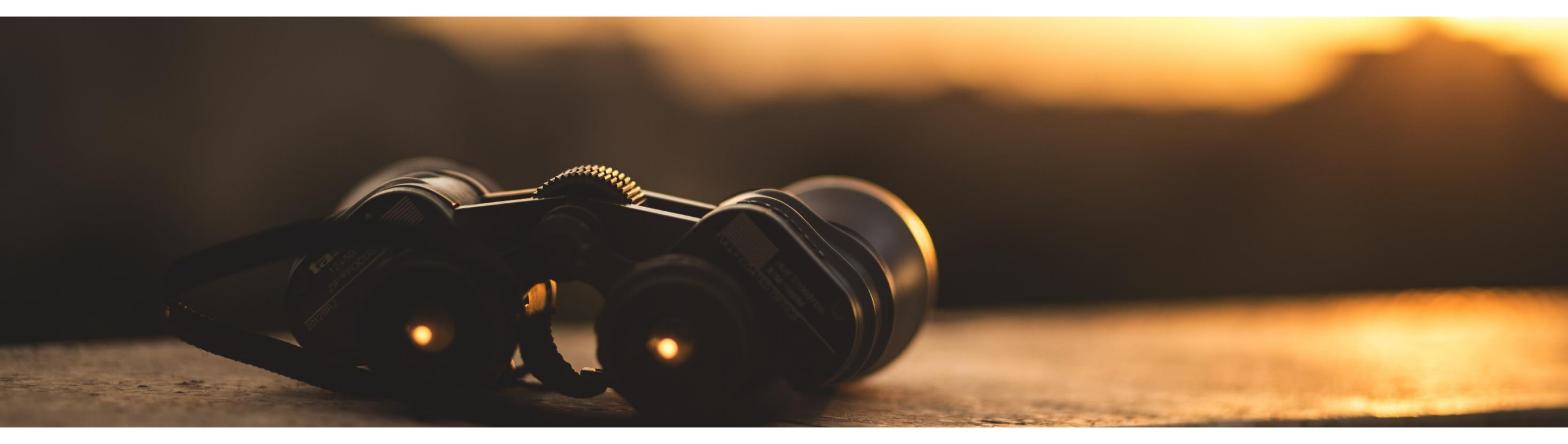
What is visibility?