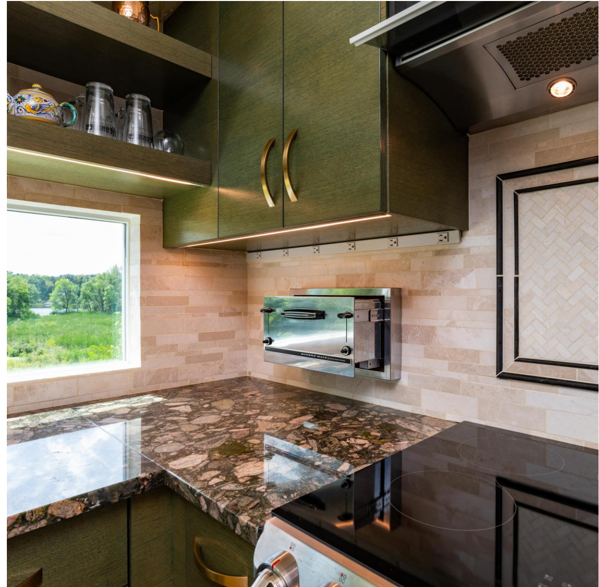
...and pulls out when needed resulting in clutter free countertop.