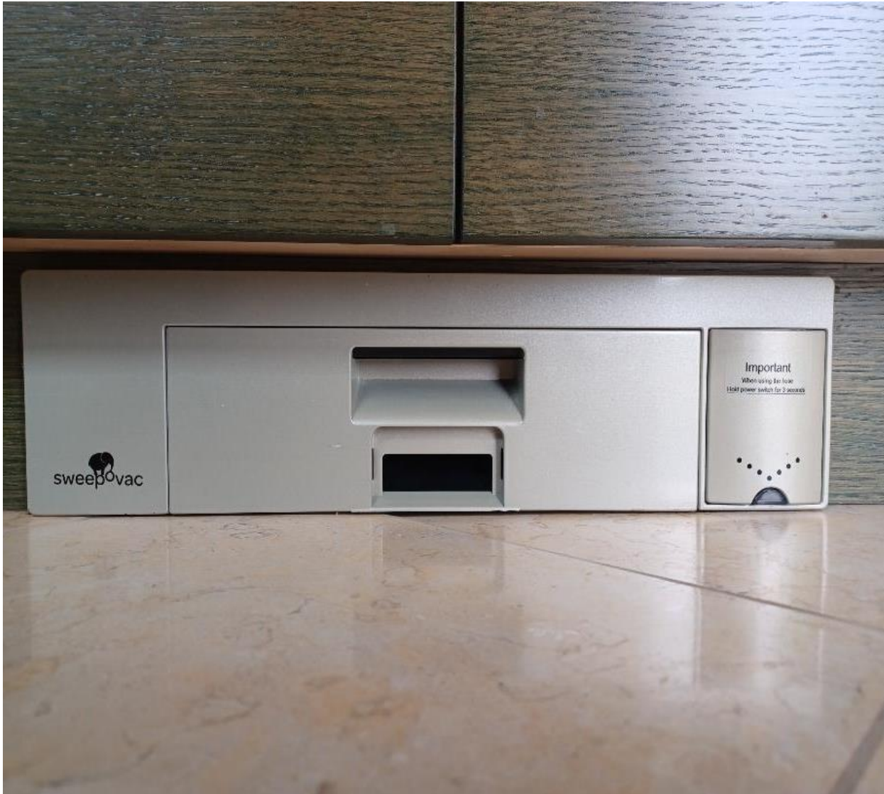
Sweepovac Big Kick, a space-saving, concealed powerful vacuum was installed. Kick the button on the right and kitchen floor debris is quickly extracted.