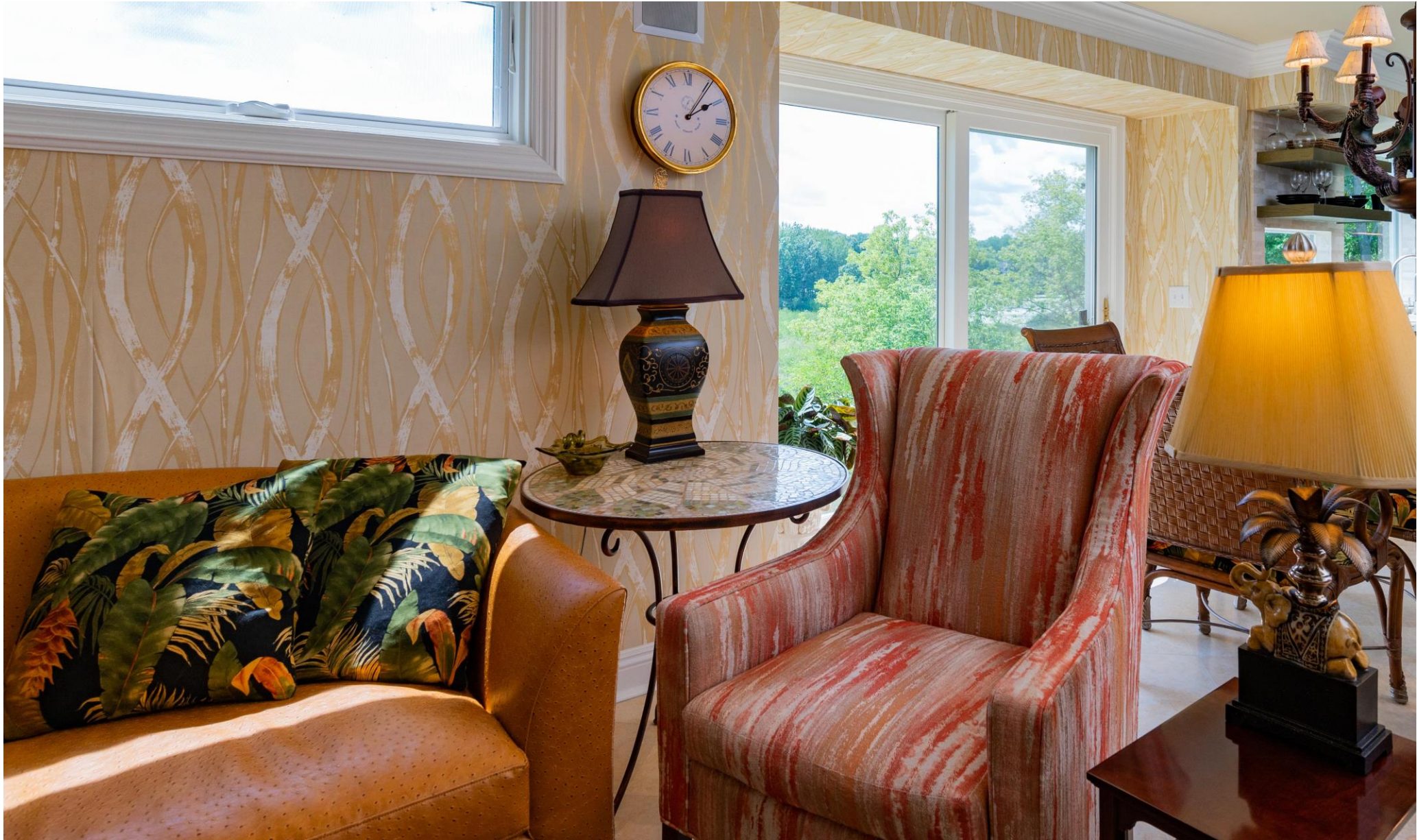
Close up of pillow pattern , elephant lamp and corner of monkey chandelier. See marsh view behind chair.