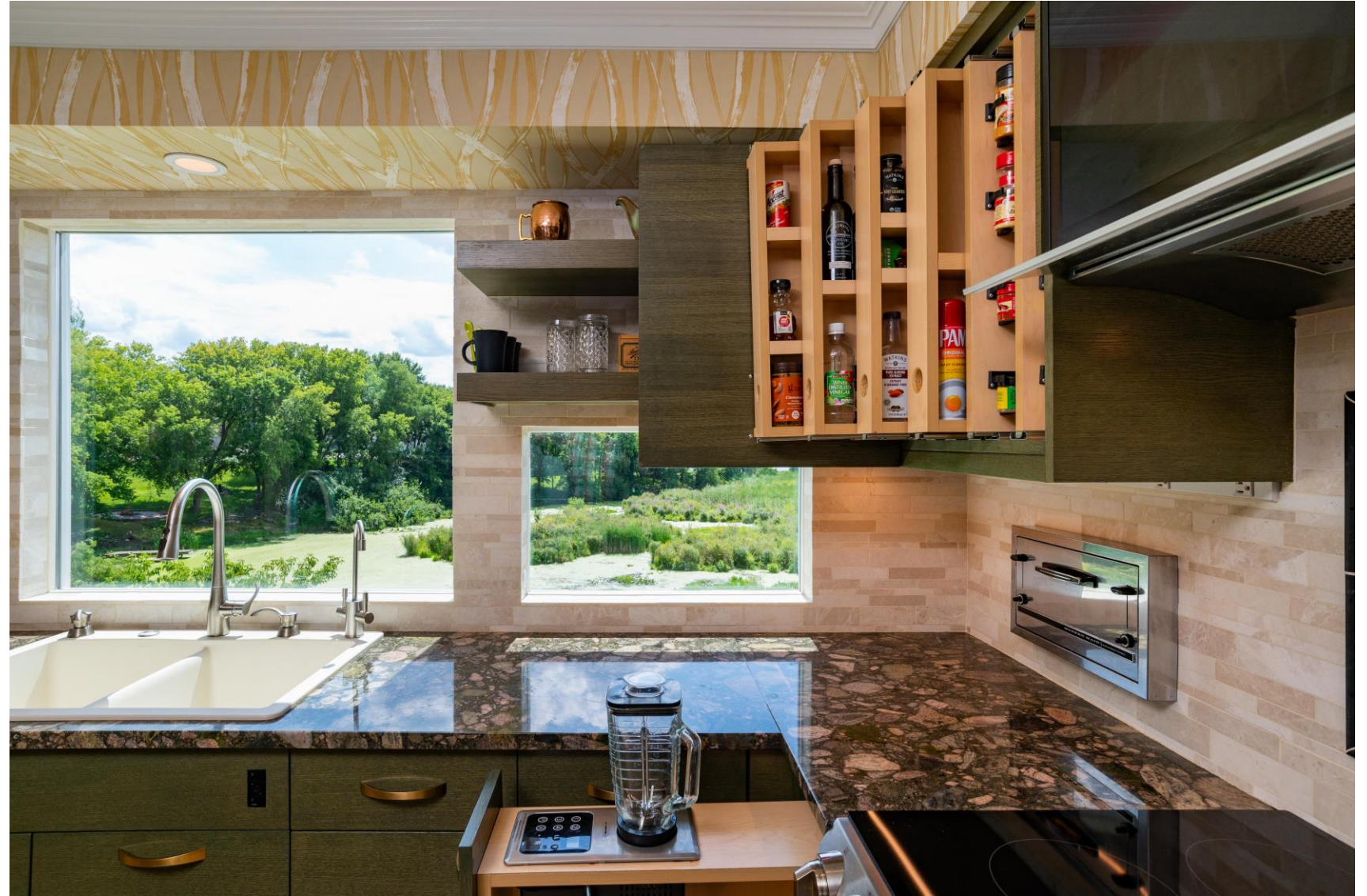
A base cabinet to the left of stove houses a pullout mixing station with a universal motor. The blender, food processor, chopper and mixer share the motor for a clutter free counter. Upper cabinets store pullout spices and oils.