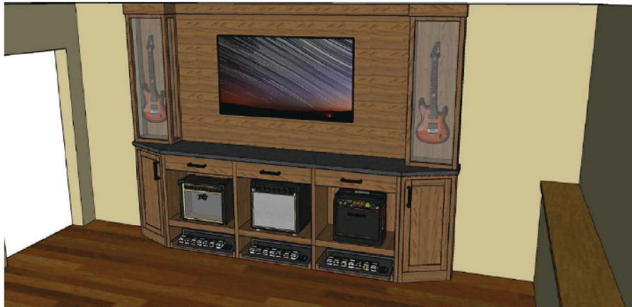
2 PROPOSED INTERIOR PERSPECTIVE (MUSIC ROOM) M.B. R.S.

In lighting from plans and specifications the colors notwithstanding that any work not depicted in outside the scope of work and will not be included in the work to be performed.