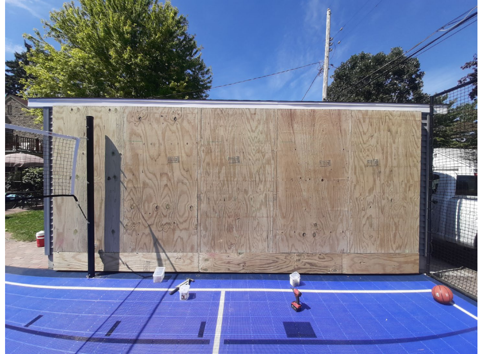
PICK-UP ON THE PARKWAY – 2023 COTY AWARDS – RESIDENTIAL EXTERIOR