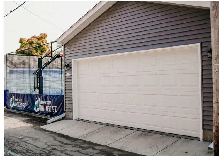
PICK-UP ON THE PARKWAY – 2023 COTY AWARDS – RESIDENTIAL EXTERIOR