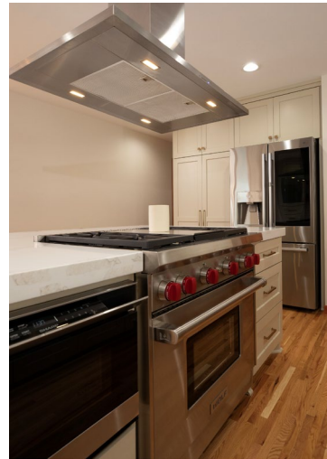
MID-CENTURY MARVELOUS – 2023 COTY AWARDS – RESIDENTIAL KITCHEN