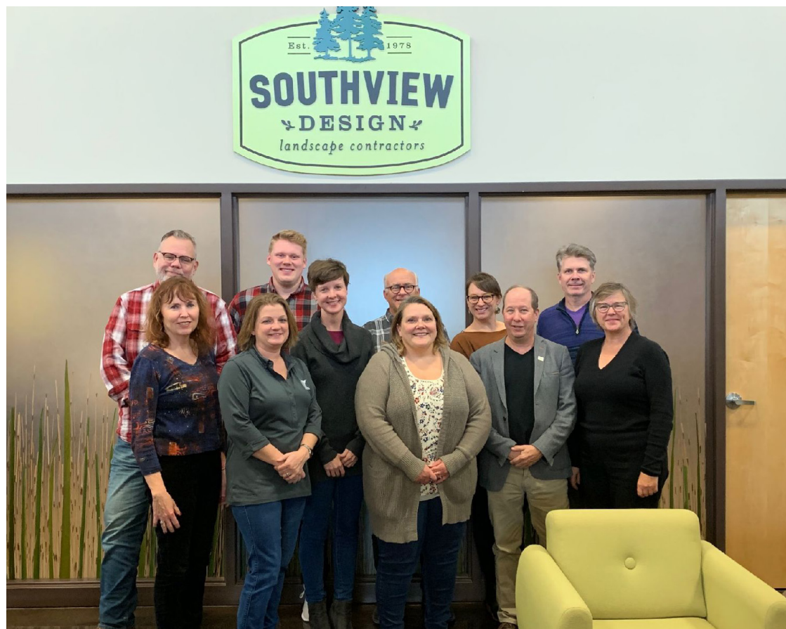
Picture taken at the 2020 Board Retreat, hosted by Southview Design.