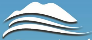
Table Rock Lake Chamber of Commerce