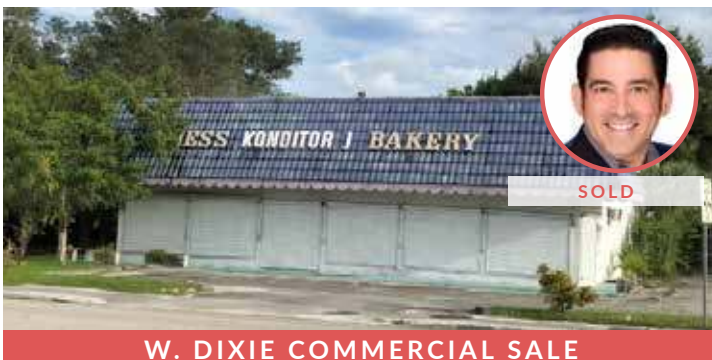
W. DIXIE COMMERCIAL SALE