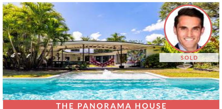
THE PANORAMA HOUSE