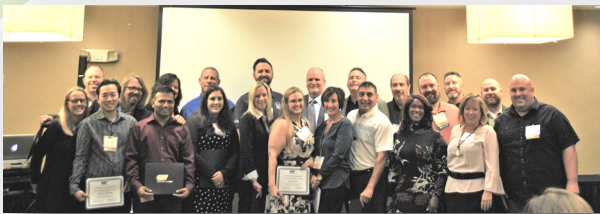
35th Leadership Class

We are so proud of our Leadership classes. Class 35 graduated from the two year program and we congratulated class 36 for completing their first year. If you would like to join class 37 in 2020, please Click here to download the application.