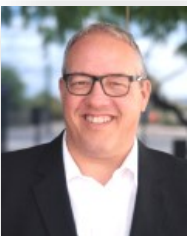
Darren Brown The Power of Testimonials Website