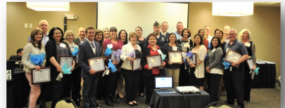
36th Leadership Class