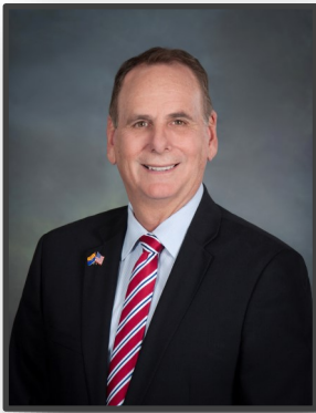
Chandler Mayor Kevin Hartke City of Chandler @ChandlerAZMayor