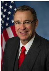
Congressional District 5 US Representative Matt Salmon (R)

2349 Rayburn House Office Bldg. Washington, DC 20515 Tel. (202) 225-2635 207 North Gilbert Rd, Suite 209 Gilbert, AZ 85234 Tel. (480) 699-8239