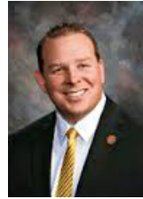
Senator Jeff Dial (R)