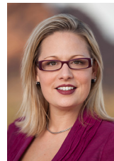
Congressional District 9 US Representative Kyrsten Sinema (D)

2349 Rayburn House Office Bldg. Washington, DC 20515 Tel. (202) 225-2635 207 North Gilbert Rd, Suite 209 Gilbert, AZ 85234 Tel. (480) 699-8239