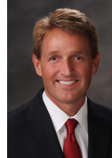
US Senator Jeff Flake (R)

241 Russell Senate Office Bldg. Washington, DC 20510 Tel. (202) 224- 2235 2201 East Camelback Rd, Suite 115 Phoenix, AZ 85016 Tel. (602) 952-8702