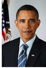
United States President (D) President Barack Obama

The White House 1600 Pennsylvania Avenue, NW Washington, DC 20500 Tel. (202) 456- 1111 www.whitehouse.gov