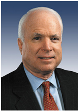
Senator John McCain (R)

The White House 1600 Pennsylvania Avenue, NW Washington, DC 20500 Tel. (202) 456- 1111 www.whitehouse.gov