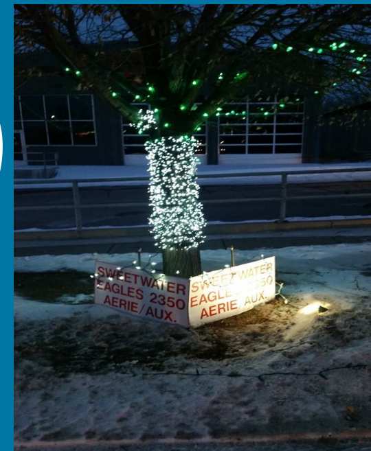
Fraternal Order of Eagles 2350