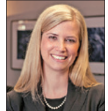
Crystal Howard Spencer Fane LLP