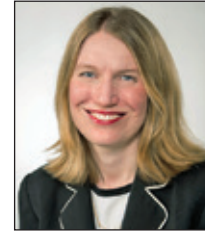
Page Burks Black & Veatch