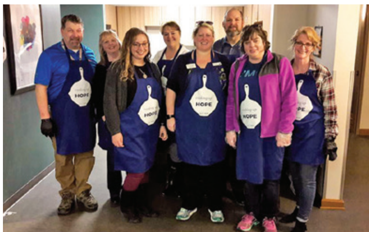
Chamber Diplomats recently volunteered at Hope Lodge, a cancer patient and caregiver home away from home facility of the American Cancer Society . They conducted a "stock the pantry" drive, then cooked and served a meal for patients and their caretakers.