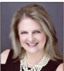
Lynde Tyrrell Overland Park Regional Medical Center