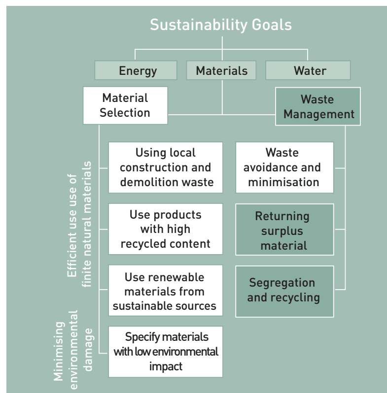
Figure 1. Materials resource efficiency as part of sustainable construction

It is important that designers also adopt the 'waste hierarchy' (Figure 2) that focuses initially on reducing waste, as this is where potentially larger impacts can be made. The efficient use of materials reduces the quantity of materials used in the first instance, lowers the material purchasing costs, minimises waste and eliminates the need for subsequent handling and disposal costs. Developing a strategy to reduce waste is one of the most effective ways to address waste in construction. Once effective waste reduction measures are in place, it is then more appropriate to consider how to reuse, recycle, recover or finally dispose of waste in a structured way.