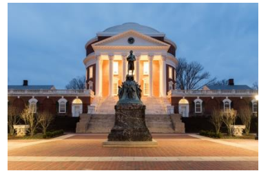
The Rotunda at the University of Virginia