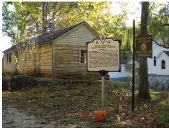
A school of the Monacan Nation

https://louisahistory.org/ https://www.orangecovahist.org/