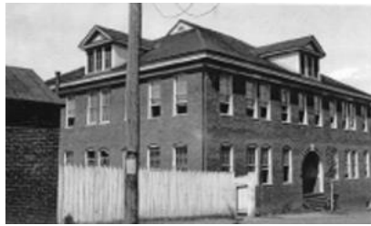
The historic appearance of the Jefferson School circa 1940-1950