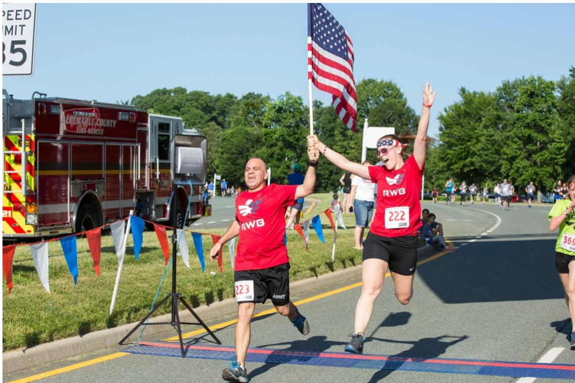
Team Red White and Blue at the 4 Our Freedom 5k