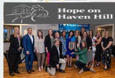
Hope on Haven Hill