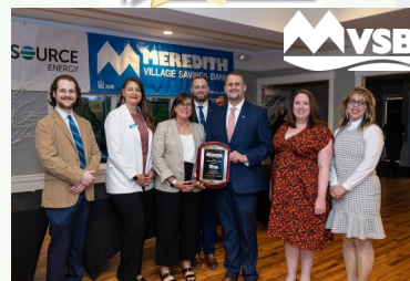
Meredith Village Savings Bank