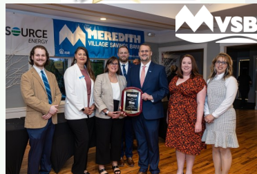
Meredith Village Savings Bank