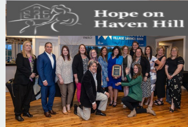
Hope on Haven Hill