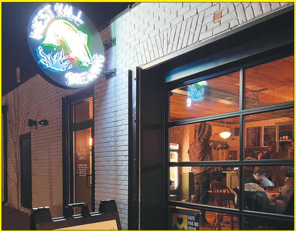
Thanks to our YUP MeetUp Host, West Kill Supply, 602 Broadway, Kingston.